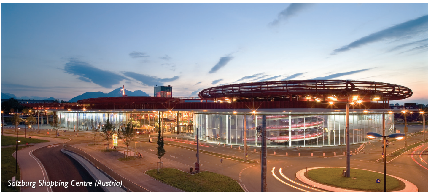
Salzburg Shopping Centre (Austria)